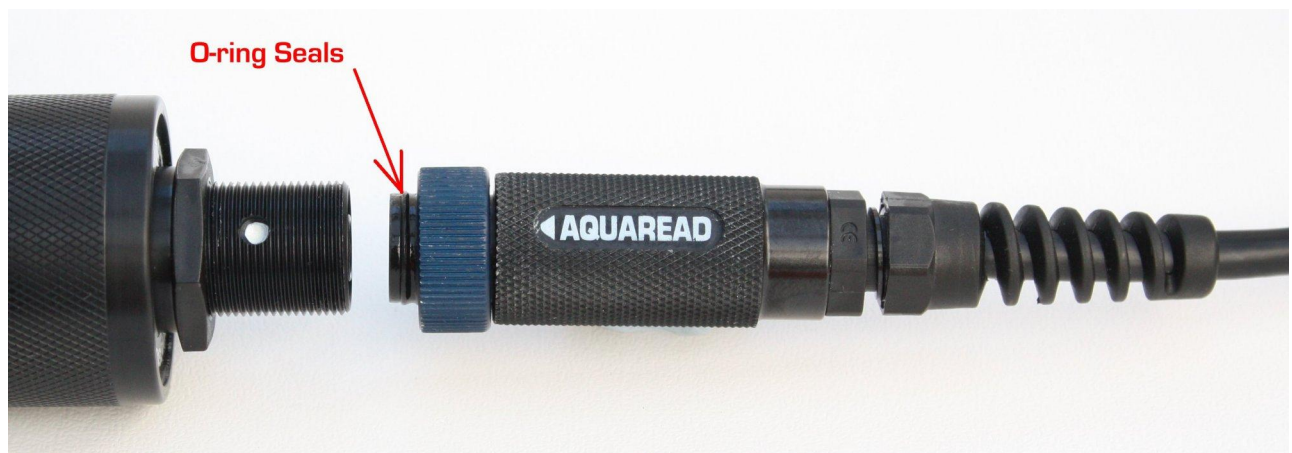
Seals at Aquaprobe end

The Aquaprobe Extension Cable features high-pressure metal connectors, which incorporate several O-ring seals. Prior to first connection, the seals must be lubricated using the silicone grease supplied with the Aquaprobe.